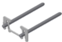
Flat Pin Keeper