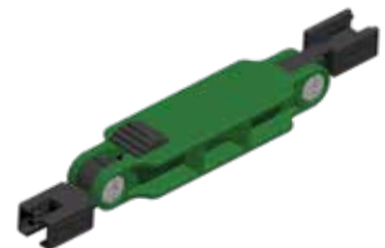
Ferrule Insertion/Removal Tool