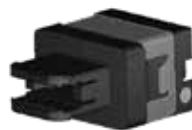
Optional Panel Clip Mounting