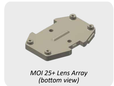
MOI 25+ Lens Array (bottom view)